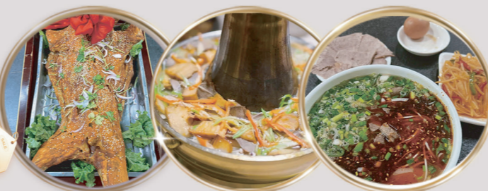
烤全羊 Roasted whole lamb 青海土火锅 Qinghai Local Hot Pot 兰州牛肉面 Lanzhou Beef Noodles